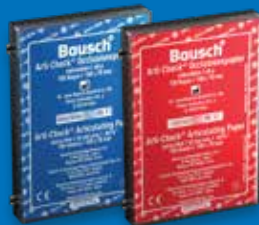
BK11 & BK12 100 Sheets