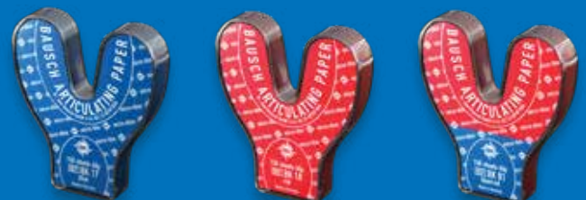
BK17, BK18, & BK81 150 Sheets