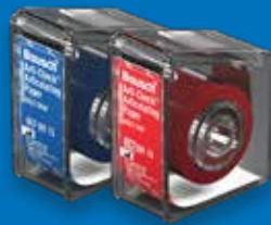
BK15 & BK16 22mm Wide