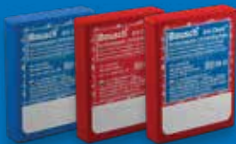
BK61, BK62, & BK63 200 Strips