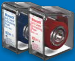
BK13 & BK14 16mm Wide